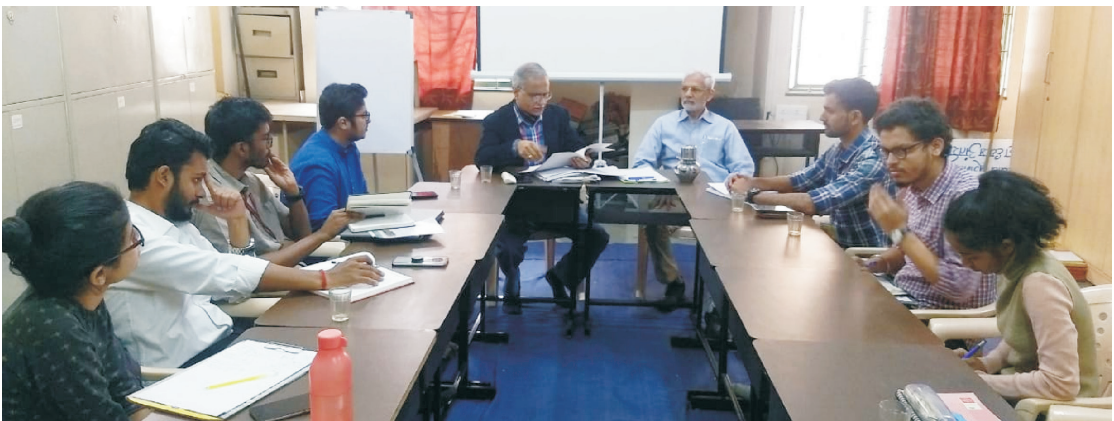
NINS - Cyber Task Force Meeting