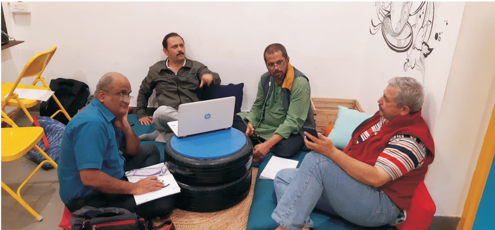
Art And Culture Group