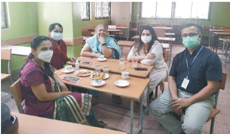
Meeting about action plan in Velhe taluka

o Will transform into SPG since it will tackle national & global health issues.