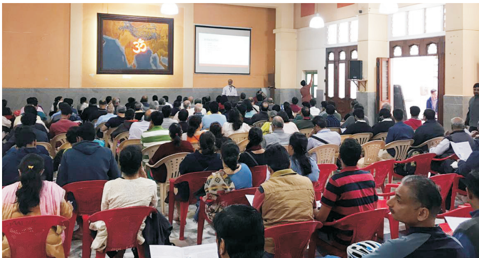
All SPG Meet January 2020