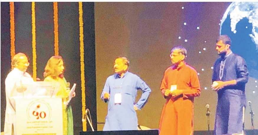
Emerging Technologies Group