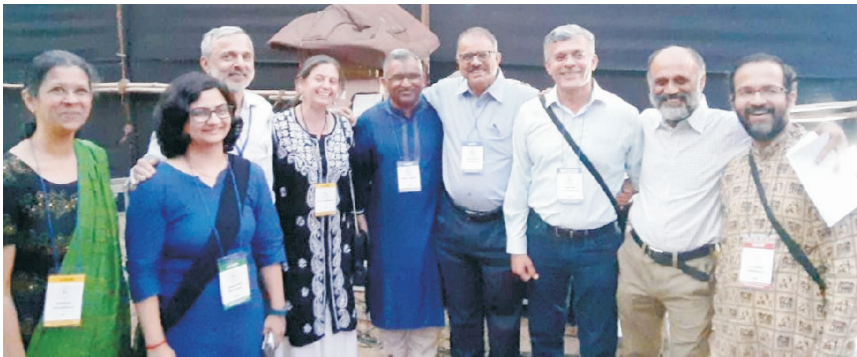
Ecology and Environment