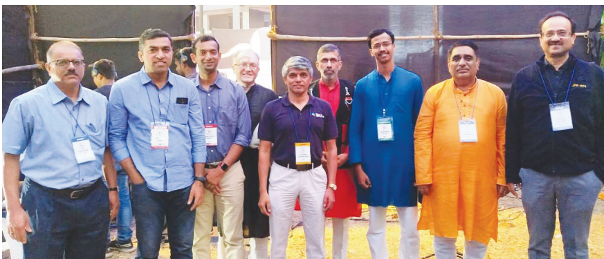
Livelihood And Employment